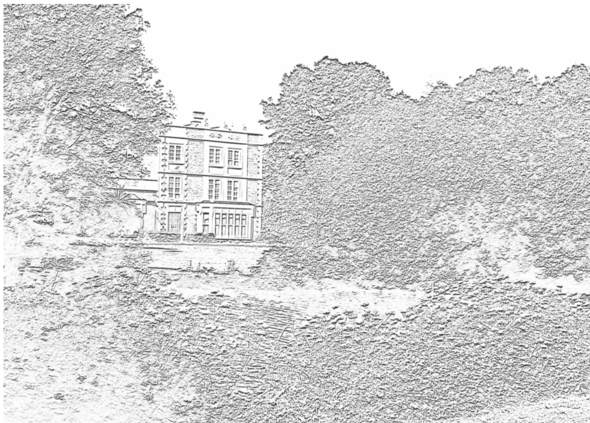
Rose Bruford College